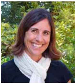
Carissa Medina Middle School