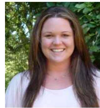
Kiley Woods Health & Wellness