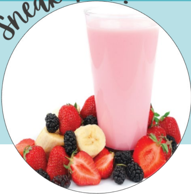
Fresh Smoothie Bar Coming Soon